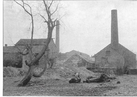
Mill complex, Havannah 1950s

We also played in the fields and woods. We used to make rope swings so we could swing across the river. I have such vivid memories of even where each flower grew and where the various wild animal habited. There is a cave in the wood which it was said came out in Eaton church yard. I think our imaginations went away with us as we believed there were human remains in there as well.