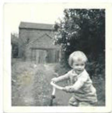
The author in her younger days!!!

As children in the village, we never really ventured out only to the farm at the top of the road or to Church or Eaton school which is now a house. We had enough gone on to occupy ourselves in our little piece of heaven. I had to most wonderful happy childhood we were very privileged to have lived in such a wonderful village and this certainly gave me the priorities in life I needed to go forward. Very happy memories.