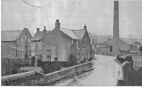
Havannah industrial village in the 1930s A view from the bridge over the River Dane